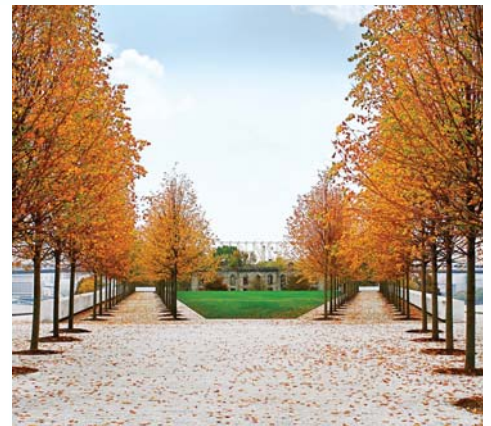
Tree Anchoring System: RF2P

PDEA®, ARGs® and ARVS® are Registered Trademarks of Platipus Anchors. Platipus Anchors technology is protected by International Patents, Trademarks and Registered Copyright.